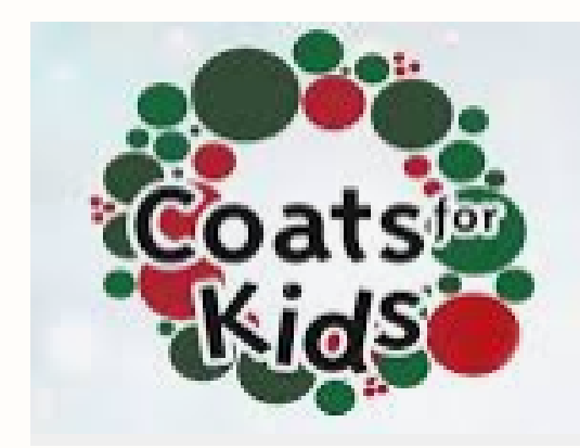
Please select AISD (Austin Independent School District) and then find school in list in the next page.