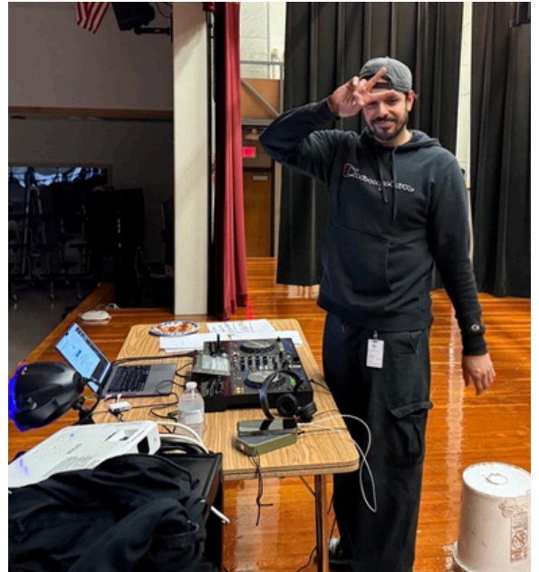
Valentines Day Dance