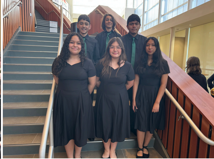
All City Band