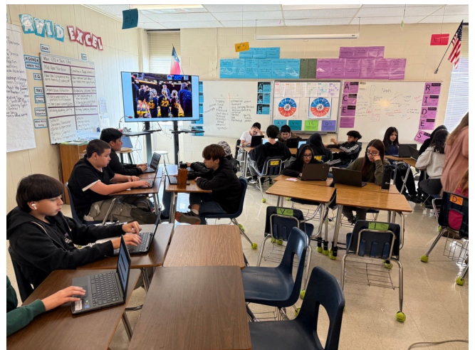
Writing in Advisory